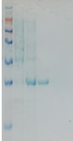
Figure 2: Purification of GST-DYKDDDDK Protein Standard. Lane 1: MW STDs; Lane 2: E.Coli Whole Lysate (-IPTG); Lane 3: E.Coli Whole Lysate (+IPTG); Lane 4: Elution Fraction for DYKDDDDK tag GST Protein Standard.