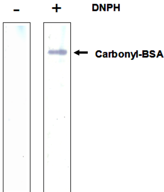
Figure 1: Immunoblotting of Oxidized BSA. Carbonyl-BSA, Oxidation Immunoblot Control, was first electroblotted onto nitrocellulose membrane. Following the electroblotting procedure, the membrane was incubated with (right strip) or without (left strip) DNPH solution. The derivatized Carbonyl-BSA is detected by immunoblotting with anti-DNP antibody as described in the Assay Protocol.